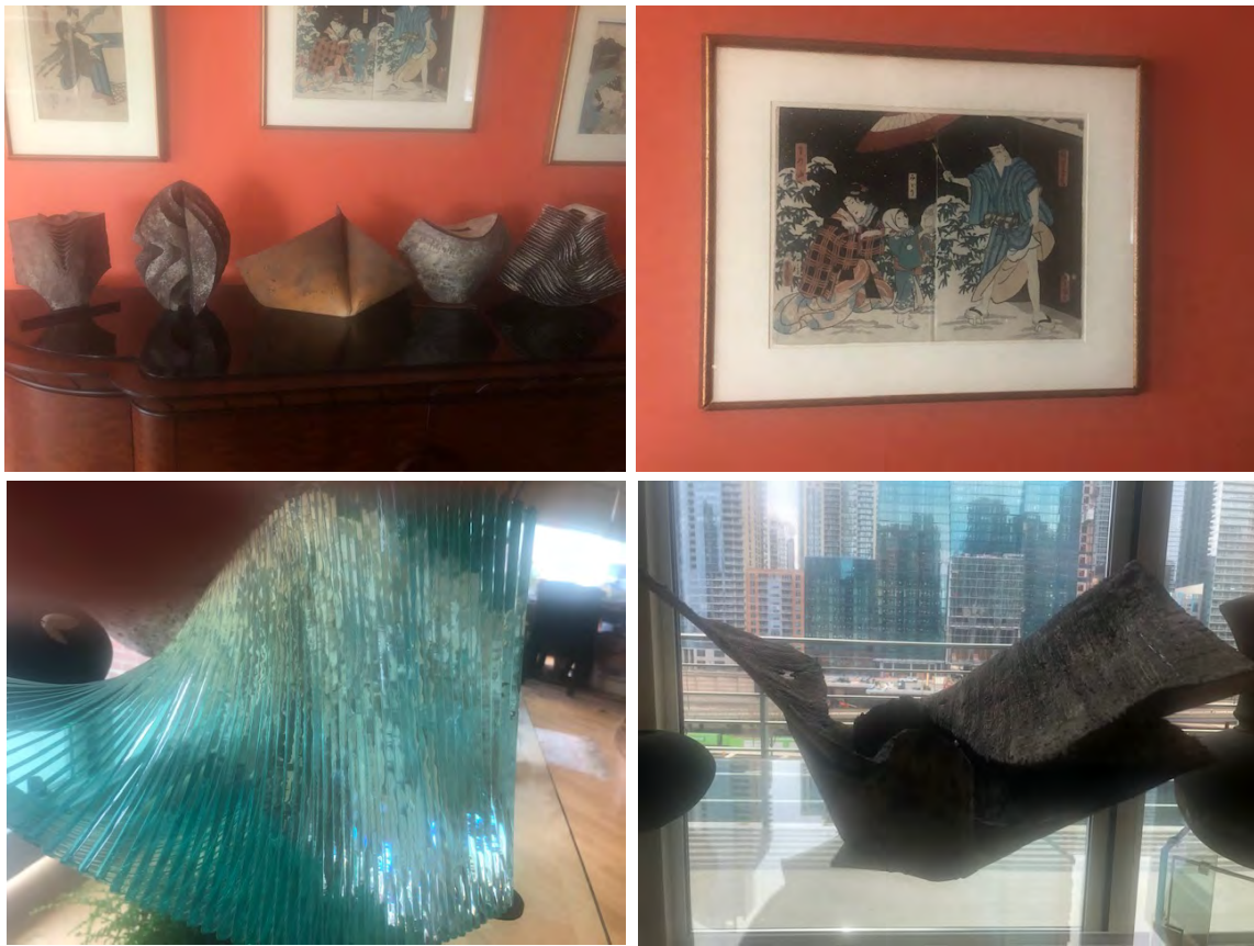
Beautiful works of art from Japanese artists in my house

My participation in the 2020 50Th Anniversary of the JSNP is particularly meaningful to me. It is an honor to be a plenary speaker and to have the occasion to meet with many colleagues. I look forward to continuing opportunities to visit Japan and to work with Japanese scientists engaged in the field I continue to find fascinating. I hope there will be more visits. I feel a great kinship to Japan and extend my congratulations to all who made it such a memorable meeting. I wish the Society a great future and hope to continue my association with it.