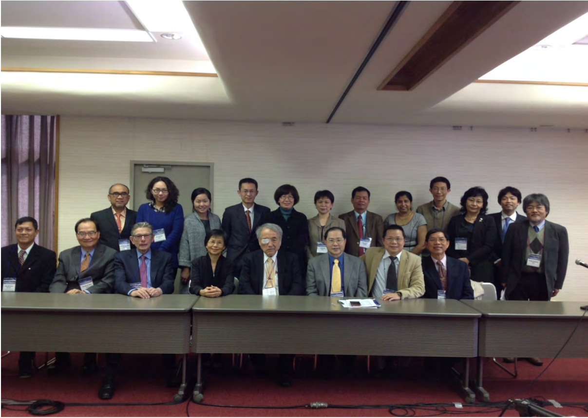
2015 Nov WPA REAP Symposium Taipei.