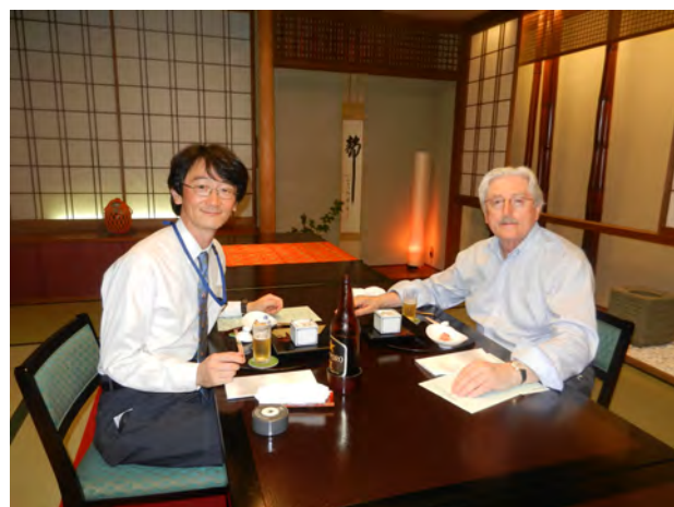
Visit to a Ryotei in Tokyo in 2012 (田町, 牡)