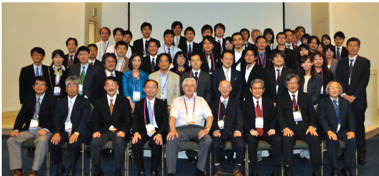
Japan Night at 2nd AsCNP Congress in 2011 (Seoul)