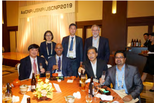
(Photo 4, Members from AsCNP and JSNP in 6th

In Chinese, there is a proverb called "海纳百川，有容乃大," which means the grand ocean accommodates every river. I think it is the same spirit of JSNP, openness of every member that made today's JSNP great accomplishment.