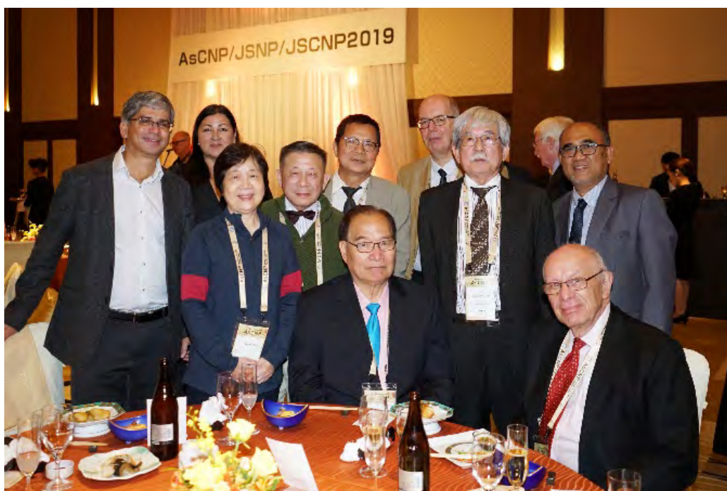
AsCNP/JSNP/JSCNP2019 Fukuoka Congress

Neuropsychopharmacology in Japan has a special place in my heart. For over forty years, I have had the great privilege of knowing leaders in psychopharmacology and psychiatry during that period, until the present day. I have mentored many young Japanese psychopharmacologists who joined my laboratory for several years at a time. Many have gone on to become leaders of Japanese academic programs and program leaders in pharmaceutical companies in Japan. I have been a consultant and grantee from many Japanese pharmaceutical companies. I have been invited over a dozen time to speak in Japan at national and international meetings and am planning to return later this year. I treasure my trips to Kyoto, Osaka and Tokyo. I have collected many beautiful works of art from Japanese artists. I continue to do so.