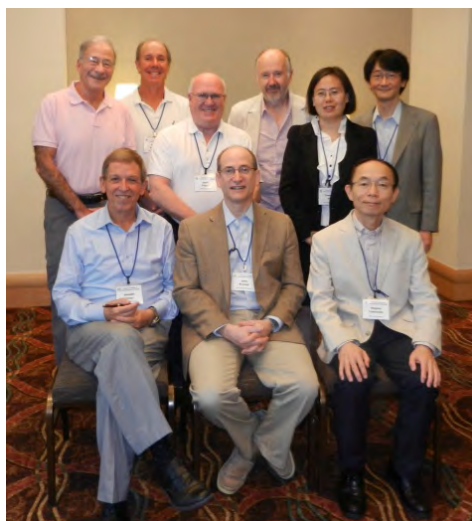
(Photo2. Members from CINP/ JSNP/ AsCNP Executive Committee)