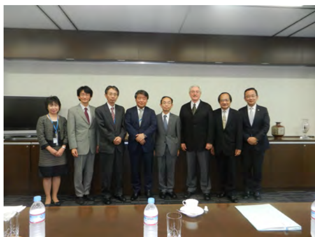
Visit to Otsuka Pharmaceutical Co., Ltd. in 2012 丹)