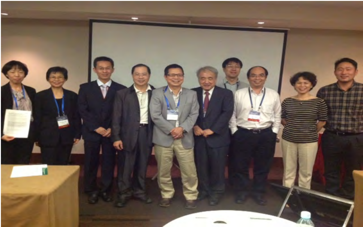
2015 March, 5th World Congress of Asian Psychiatry, Fukuoka Japan